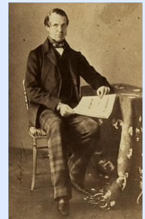
Earl Cowley 1804-84

Wanstead Flats was enclosed by fences from Bushwood to Ridley Road by Earl Cowley's agents, but in July 1871 a protest meeting against the enclosure was called on Wanstead Flats and thousands turned up. Despite the pleas of the organising committee the crowd refused to disperse after the meeting and in the evening began to break down the fences near the corner of Capel Road.